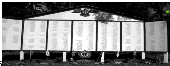
Veterans Memorial Board